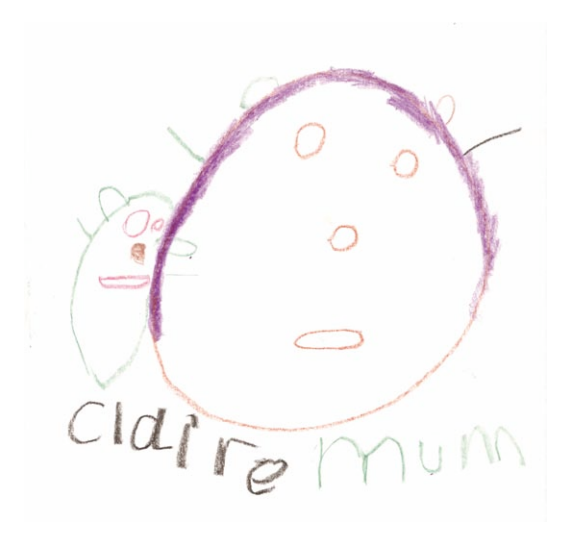
FIG 7 Child's drawing coded as showing enmeshment.

similar relationships between form and mental state can be identified (Langer 1953).