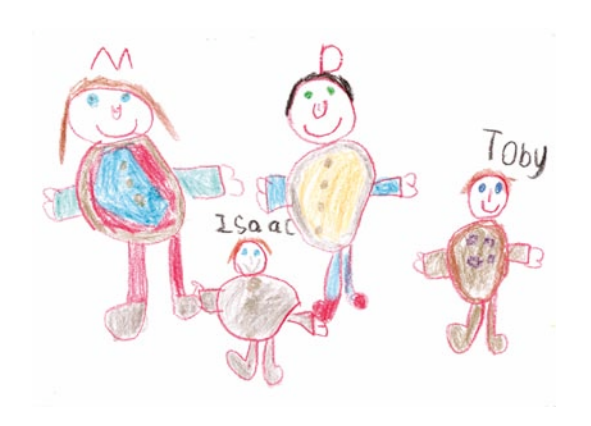
FIG 6 Child's drawing coded as showing happiness (author's collection).

These studies, then, suggest that a systematic analysis of the form of children's drawings relates to measured aspects of their mental state. Although the equivalent analysis in relation to adult art is inevitably more complex (and certainly influenced also by aspects of shared cultural style at a particular time), much literature suggests that