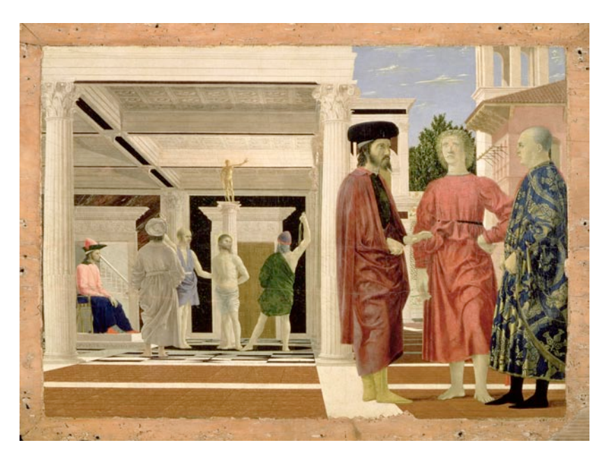
FIG 8 Piero della Francesca, Flagellation of Christ. c.1455.

A different kind of perceptual gestalt leading to meaning is illustrated in Howard Hodgkin's painting of Keith and Kathy Sachs (Fig. 9). If you first look at this painting fresh without pre-knowledge, it is just an abstract assembly of shapes and colours. Then add the verbal part of the painting (i.e. the title) and the knowledge that it is a double portrait of two art collectors. The abstract shapes suddenly click into different focus. This changed perception transforms our response – we intuit a mental life in the image (human personality and relationships). The radical shift in our feelings here is a measure of the power of the image to embody mental life.