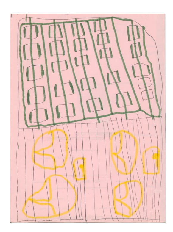
FIG 10 The gates of Buckingham Palace, drawn by a 10-year-old boy with autism (author's collection).

This idea of direct engagement with painting — on the part of the artist and of the viewer — the idea that there is a unified single authorial voice or meaning in the work with an emphasis on authenticity is characteristic of a particular style of art. By apparent contrast, the years since the mid-20th century have been dominated by something apparently rather different: an ironic and knowing distance of artist from work; a