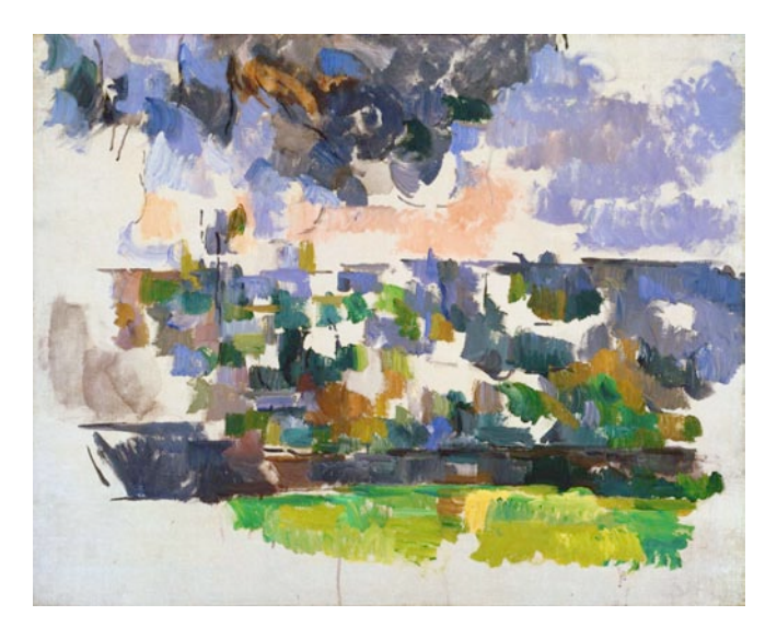
FIG 3 Paul Cézanne, The Garden at Les Lauves, c. 1906. The Phillips Collection, Washington, DC.

incomplete at an early stage (Fig. 3), the other more tightly finished (Fig. 4), illustrate the progression.