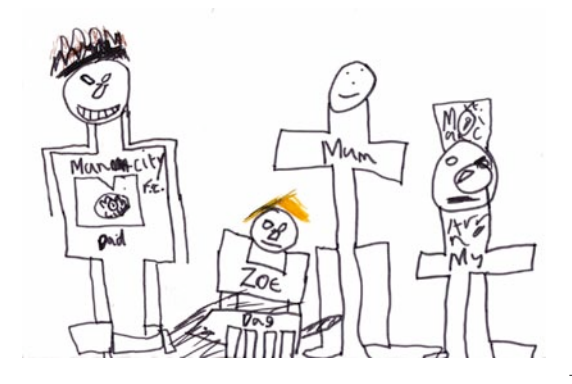
FIG 5 Child's drawing coded as showing bizzareness (author's collection).1

11 thank the anonymous young artists of the drawings in Figs. 5, 6, 7 and 10. Figures 5–7 were first published in The Times (Davies 2001).