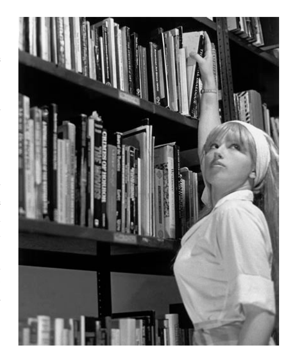
FIG 11 Cindy Sherman, Untitled film still No. 13, 1978 (courtesy of the Artist and Metro Pictures).

constant qualification of passion or engagement and a spirit of reflexiveness. On the face of it, this 'postmodernism' fatally undermines the idea of the importance of 'intuiting the whole' and 'reading a painting' that I have outlined above. But there may be more to it than this. The introduction of a self-reflexiveness into experience is not just something that has happened in art criticism; it has also been characteristic of much contemporary thought within psychiatry, psychology and human sciences. What can we learn from this?