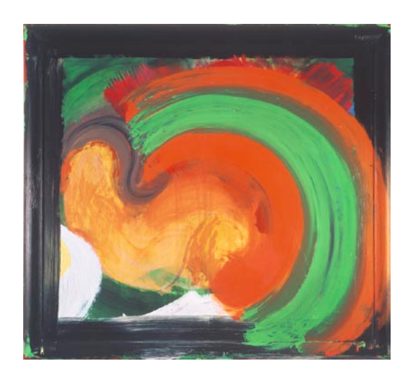
FIG 1 Howard Hodgkin, Lovers . 1984–1992 (© Howard Hodgkin. Courtesy of Gagosian Gallery, London).

shapes, recovering affect traces from his memories of specific situations (Fig. 1).